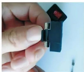
4. Prepare the spare fuse