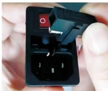
5. Install it