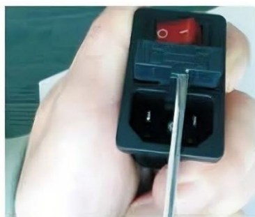
2. Turn off the power and pry up the fuse groove with a screwdriver