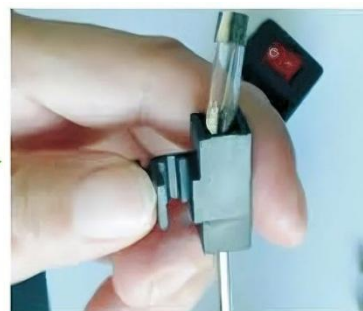
3. Remove the damaged fuse with a screwdriver