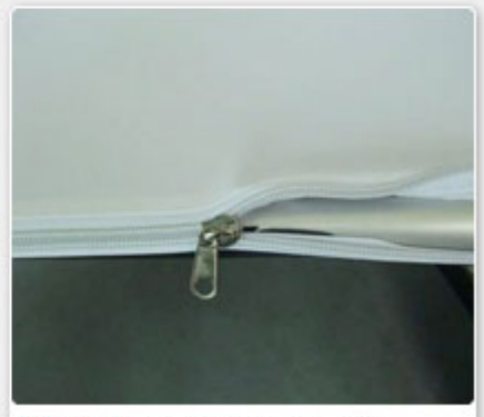
Step 4: Stand unit upright.