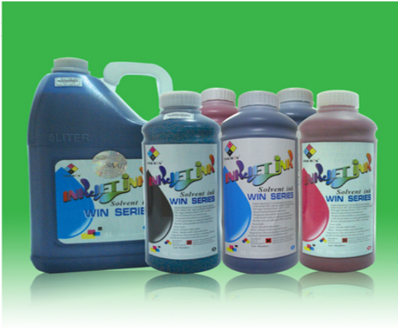
image not found http://www.sign-in-china.com/userfiles/2011-May/solvent07(1