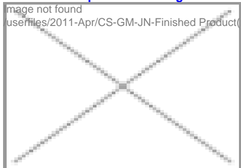
image not found userfiles/2011-Apr/CS-GM-JN-Finished Product(1).jpg