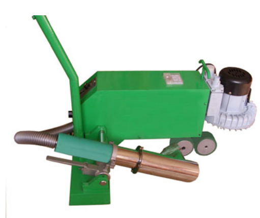
Packing Details: Packing Size: 28.3" x 21.7" x 18.1" (720 x 550 x 460mm)