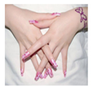
Nail Sample 1