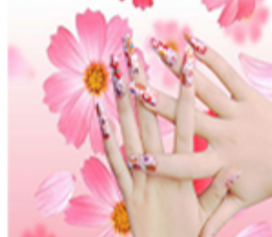
Nail Sample 2