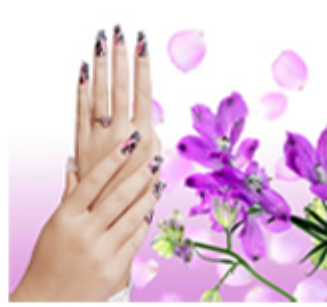
Nail Sample 3