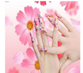
Nail Sample 2