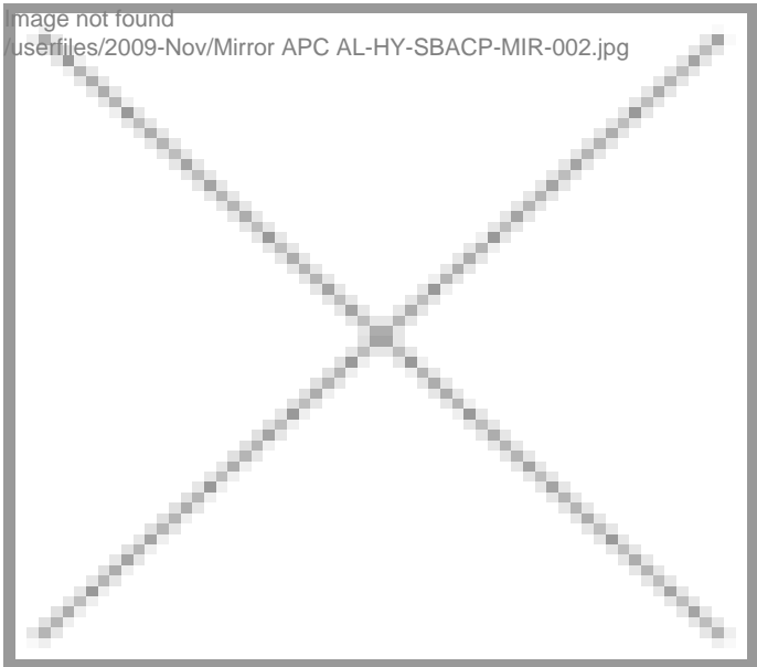
image not found userfiles/2009-Nov/Mirror APC AL-HY-SBACP-MIR-002.jpg

It is widely used in advertising, signage, engraving, etc. Such as ads show, convention centers, art buildings, highgrade building walls, star-rated hotels, airports, gas stations, etc.