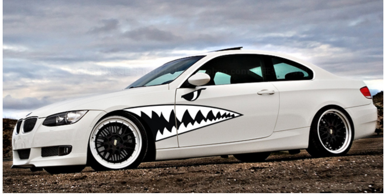
Large-format vehicle pasters/advertisement stickers are widely used.

used for the wide format digital printing indoor and outdoor, the eco solvent printing and screen printing, mainly used in advertising of the windows of the buses, taxis, subway and other means of transport, glass wall advertising, windows of shopping mall advertising.