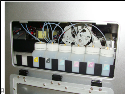
Ink Supply System