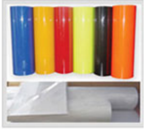
Heat Tranfer Paper\Film