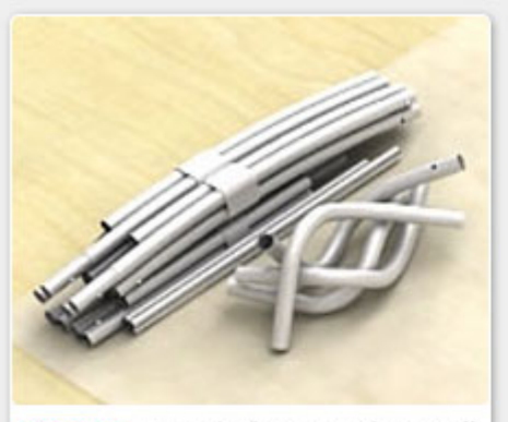
Step 1: Unpack the case then pull out large tube bag. Please keep frame & fabric clean