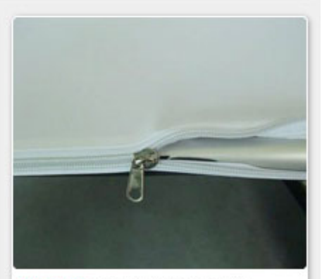
Step 4: Stand unit upright.