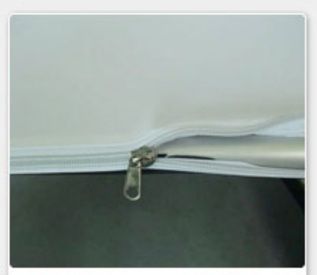
Step 4: Stand unit upright.