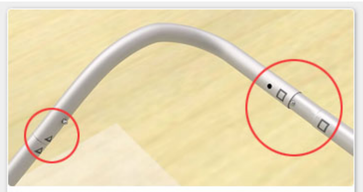
Step 2: Assemble frame following the symbol as shown on right. Symbols will be on the back side of the tube. It is best to assemble with the frame lying flat and set up right after the fabric is attached.