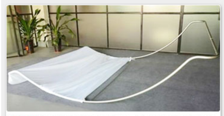
Step 3: Stretch fabric over frame. Please use Glovers or clean hands and keep fabric away from dirty substance. Put fabric over frame and secure with zipper