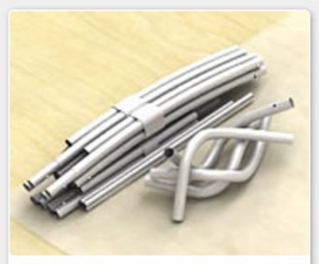
Step 1: Unpack the case then pull out large tube bag. Please keep frame & fabric clean