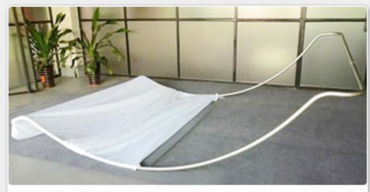
Step 3: Stretch fabric over frame. Please use Glovers or clean hands and keep fabric away from dirty substance. Put fabric over frame and secure with zipper