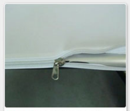
Step 4: Stand unit upright.

Includes: .Aluminum Frame .Travel case .Double Sided Graphic Print