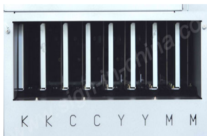
Input mode of dual 4-color