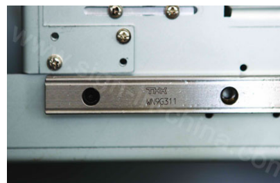
THK guide rail