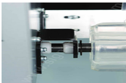
High quality fluid damp