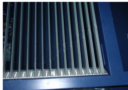
Aluminum rib working table