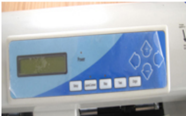
Large screen LCD with English Menu and function keys