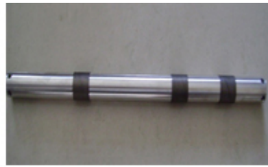
Steel stick paper feeding spindle