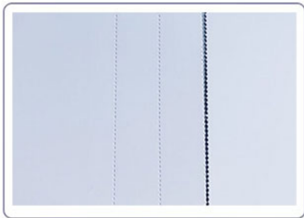
300g coated paper perforating