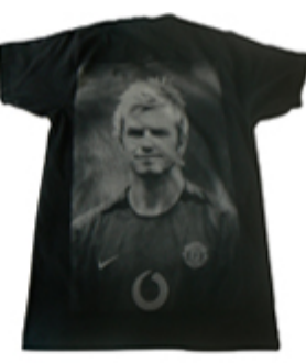
Tshirt Sample 3