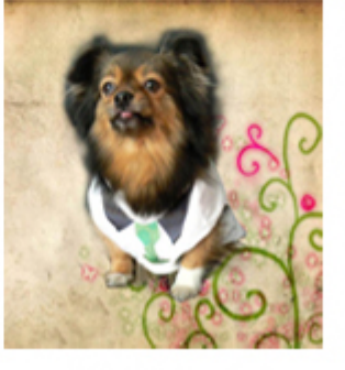
Tshirt Sample 7