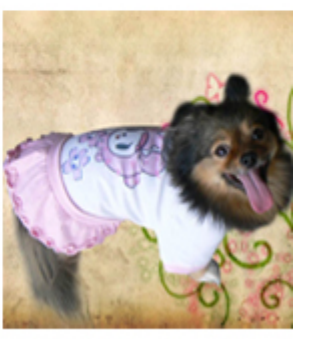
Tshirt Sample 8