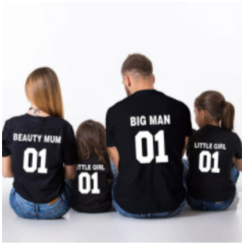
♥♥ Parent-child outfit