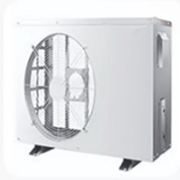
Sheet metal box