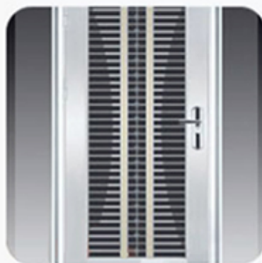
Doors and windows