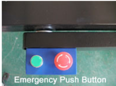
Emergency Push Button

This Pneumatic Large Format Heat Press Machine is featured by its large working table and air automatic working system. It is very efficient for transferring work in advertising industry and printing industry. The working table can be pulled and pushed easily. This machine has a reasonable and durable machinery structure for steadily using. With CE certification and 12 months warranty!