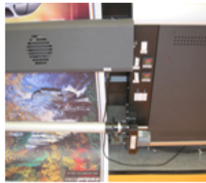
take up roller system