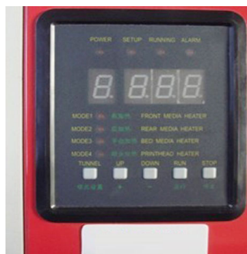
Four-in-one Electric Temperature Controller