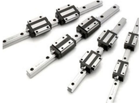
HIWIN Guide Rail