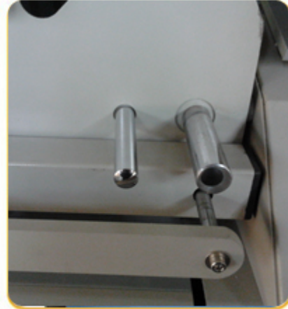
Locating Device, include Paper guide Clamp guide rod and Clamping rail