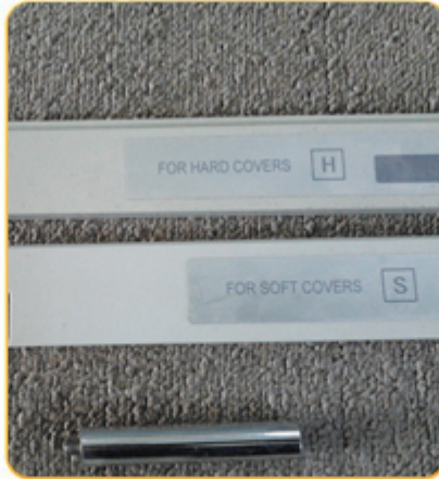
Parts for Knocking out the groove and Small Size Location