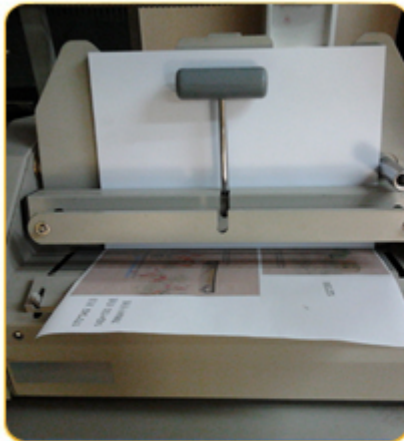
Locken use of locking device