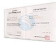
Certificate of Superior Technology Company Korea Technology Credit Guarantee Fund