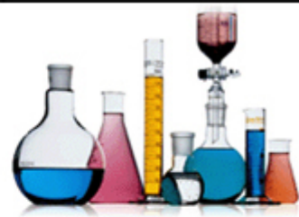
Researching and Color Mixing