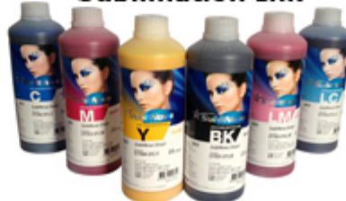
Produce Finished Sublimation Ink