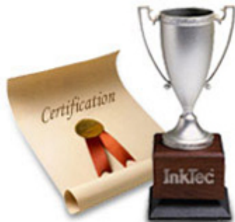
Certificate of Export Promising Small & Medium Enterprises Small Business Corporation