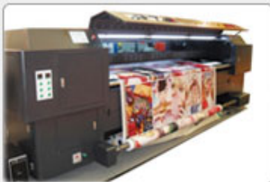
1. Large Format Printing