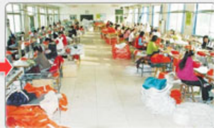
3. Special Sewing Workshop