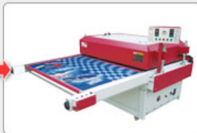
2. Heat Press Transfer