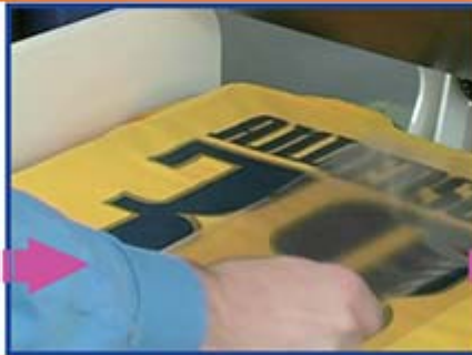
5. Carefully remove the release sheet to reveal a bright and durable finished product.