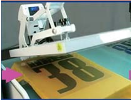
4. Heat press.