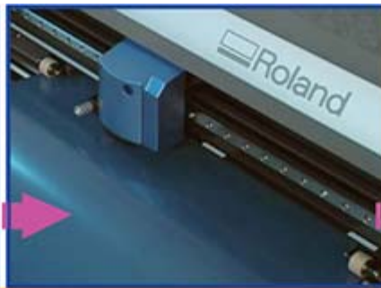
2. Write to the design for cutting.