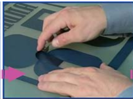
3. Weed excess vinyl away from the graphic.