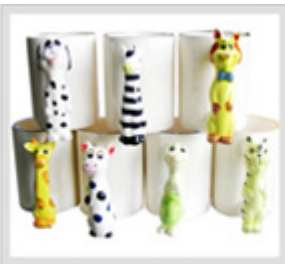
heat transfer blanks