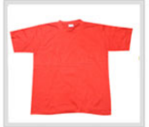
Heat Transfer Blanks