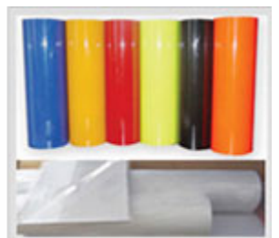
Heat Tranfer Paper\Film