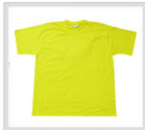
Heat Transfer Blanks