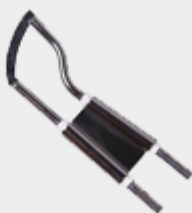
Blade x 1PC