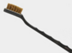
Wire Brush x 1PC