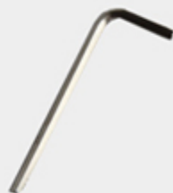
Little Wrench x 1PC