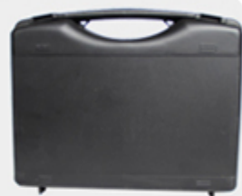
Plastic Toolbox x 1PC