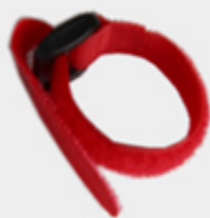
Strap x 1PC