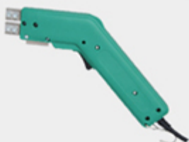
Hot Heating Knife Cutter x 1PC