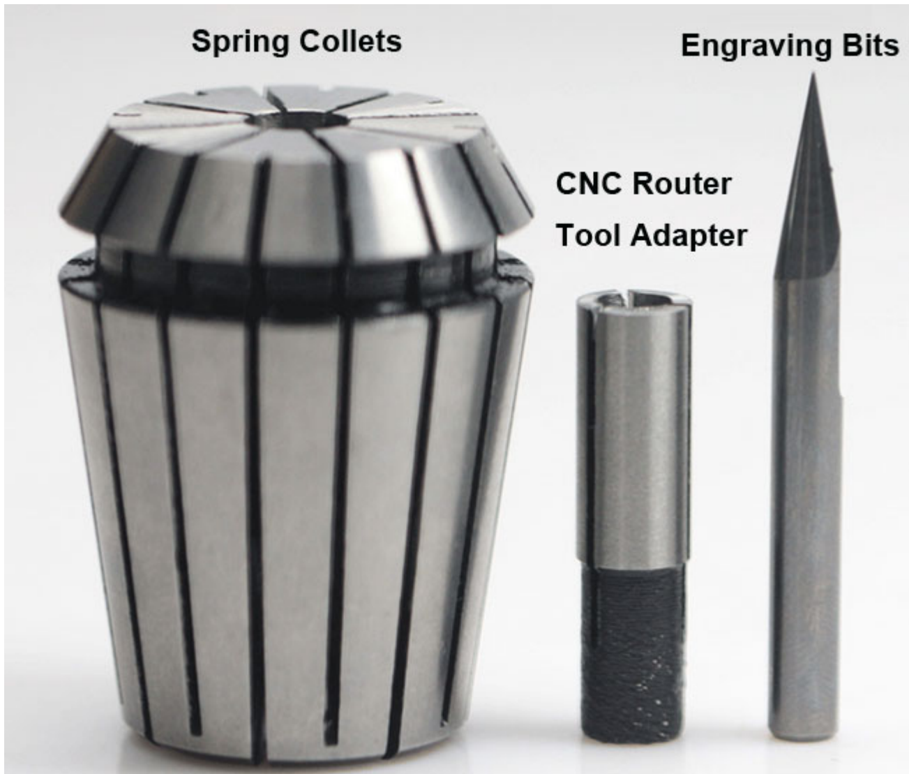
CNC Router Tool Adapter