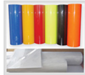
heat tranfer paper \ film