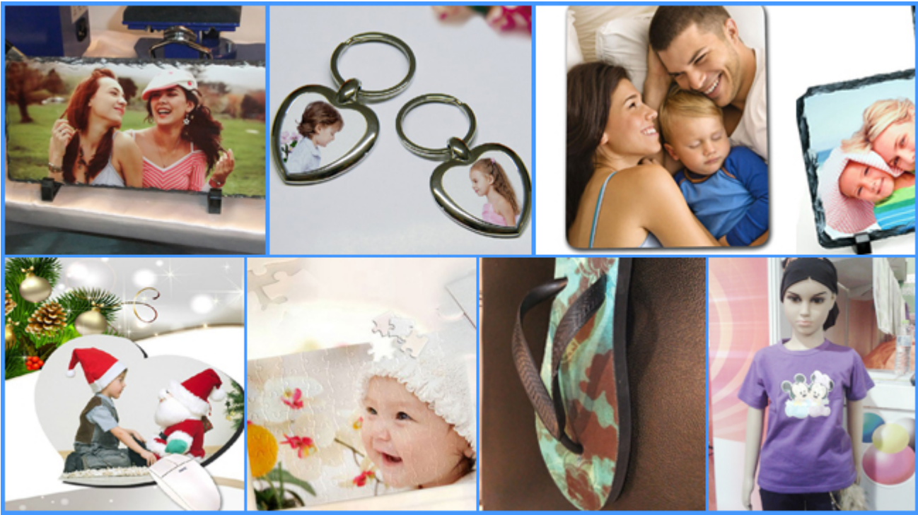
For T-shirt, Pillowcase, Puzzle, Mouse Pad, Metal Board, Fridge Magnet, Coaster, Slipper, Bag, Cushion, etc