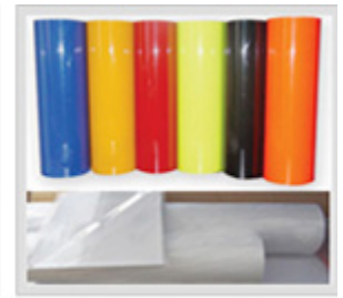
heat transfer blanks