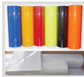
heat tranfer paper \ film