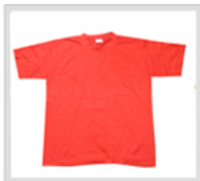
heat transfer blanks