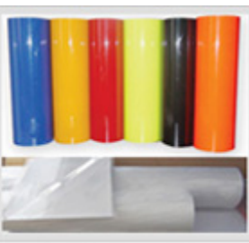
heat transfer blanks