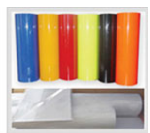
Heat Tranfer Paper\Film