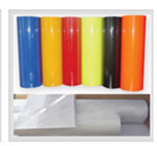
Heat Tranfer Paper\Film