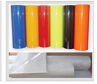
Heat Transfer Blanks