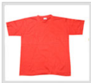
Heat Transfer Blanks