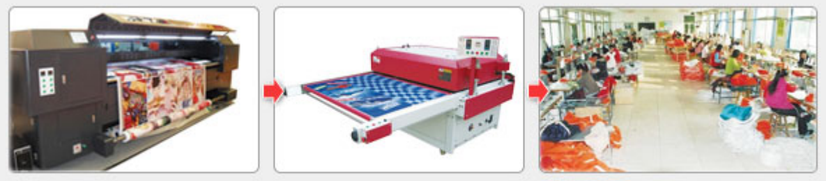
1. Large Format Printing