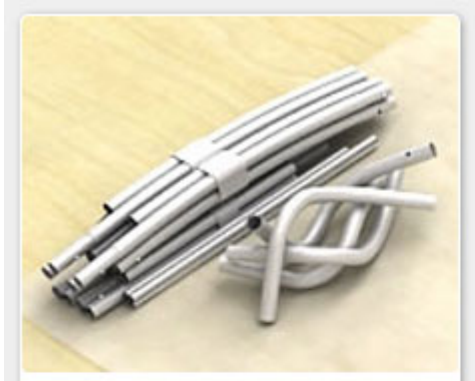
Step 1: Unpack the case then pull out large tube bag. Please keep frame & fabric clean