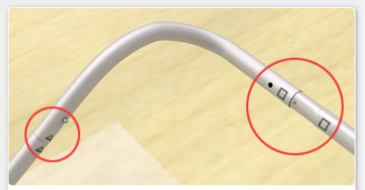
Step 2: Assemble frame following the symbol as shown above. Symbols will be on the back side of the tube. It is best to assemble with the frame lying flat and set up right after the fabric is attached.