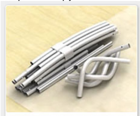
Step 1: Unpack the case then pull out large tube bag. Please keep frame & fabric clean