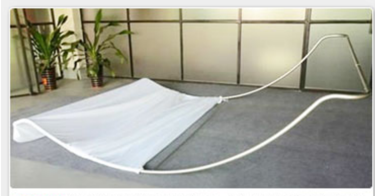
Step 3: Stretch fabric over frame. Please use Glovers or clean hands and keep fabric away from dirty substance. Put fabric over frame and secure with zipper