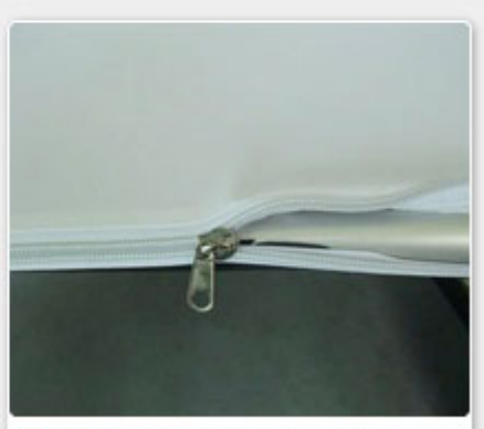
Step 4: Stand unit upright.