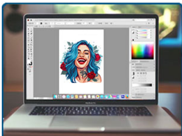
① Create your design