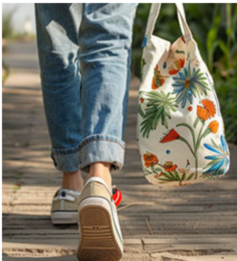
Canvas Bag / Shoes